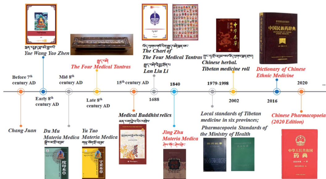
Fig. 2 The important records of P. hookeri .

the aerial parts of P. hookeri . Compound 32 is a novel iridoid oligomer. Huang et al. elucidated its structure using extensive spectroscopic analysis, including 1D-NMR and 2D-NMR experiments, and showed that it had no significant activity against