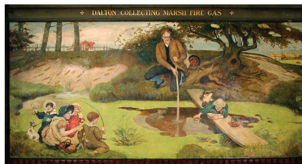
Fig. 2 "Dalton Collecting Marsh Fire Gas" is an 1887 mural by 1887 Ford Madox Brown in the Manchester Town Hall.

Atomism was a theme running through science from the late 16 th Century onwards. In his 1612 book, De Principiis atque Originibus , Francis Bacon (1561–1626) presents the case for atomism, although in subsequent work he preferred corpuscularianism. Similarly, Daniel Sennert (1572–1637) in his Hypomnemata Physica develops a model in which matter is composed of indivisible atoms although he also subscribed to the Aristotelian four elements—earth, air, fire, and water. Robert Boyle was a convinced atomist, but he also made important contributions to understanding what should be described as an element. He differed from Sennert in rejecting