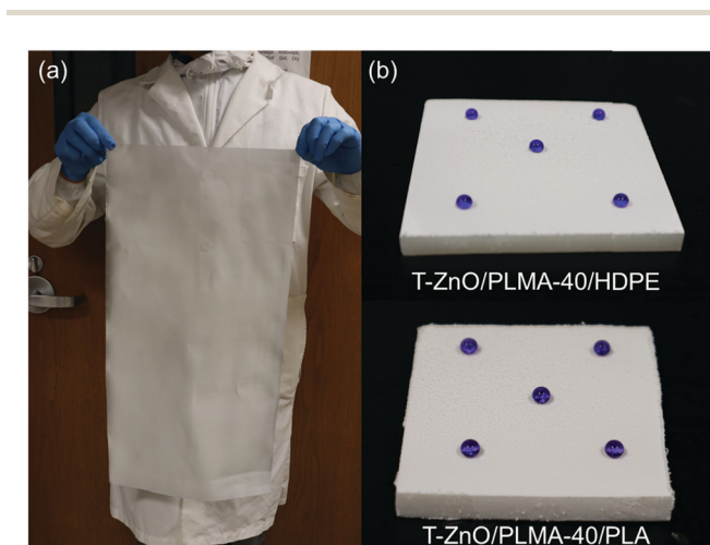
Fig. 7 Photographs of (a) a large size (30 × 60 cm) T-ZnO/PLMA-40 coated mesh; and (b) T-ZnO/PLMA-40 coated HDPE and PLA sheets with dyed blue water droplets.

The authors gratefully acknowledge the Robert A. Welch Foundation (A-1898) and Texas A&M Triads for Transformation (T3) from President's Excellence Fund for finance support of this work. LD, NRG, and SB acknowledge partial support from the National Science Foundation under IIP 2122604.