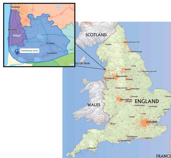
Fig. 1 Map of Fylde district council: the blue-shaded parts in the map indicate the area covered by Fylde. 20,21

Fylde is predominantly a rural area with a smaller urban area. It is one of the top hot spots for tourism experience as it is enriched with pretty villages, wetlands, seaside, canals, and dune areas; 22 hence providing countryside adventures, such as horse riding, walking, cycling, and canoeing. Fylde is very rich in sporting culture, and it is known for its golfing tradition. 23