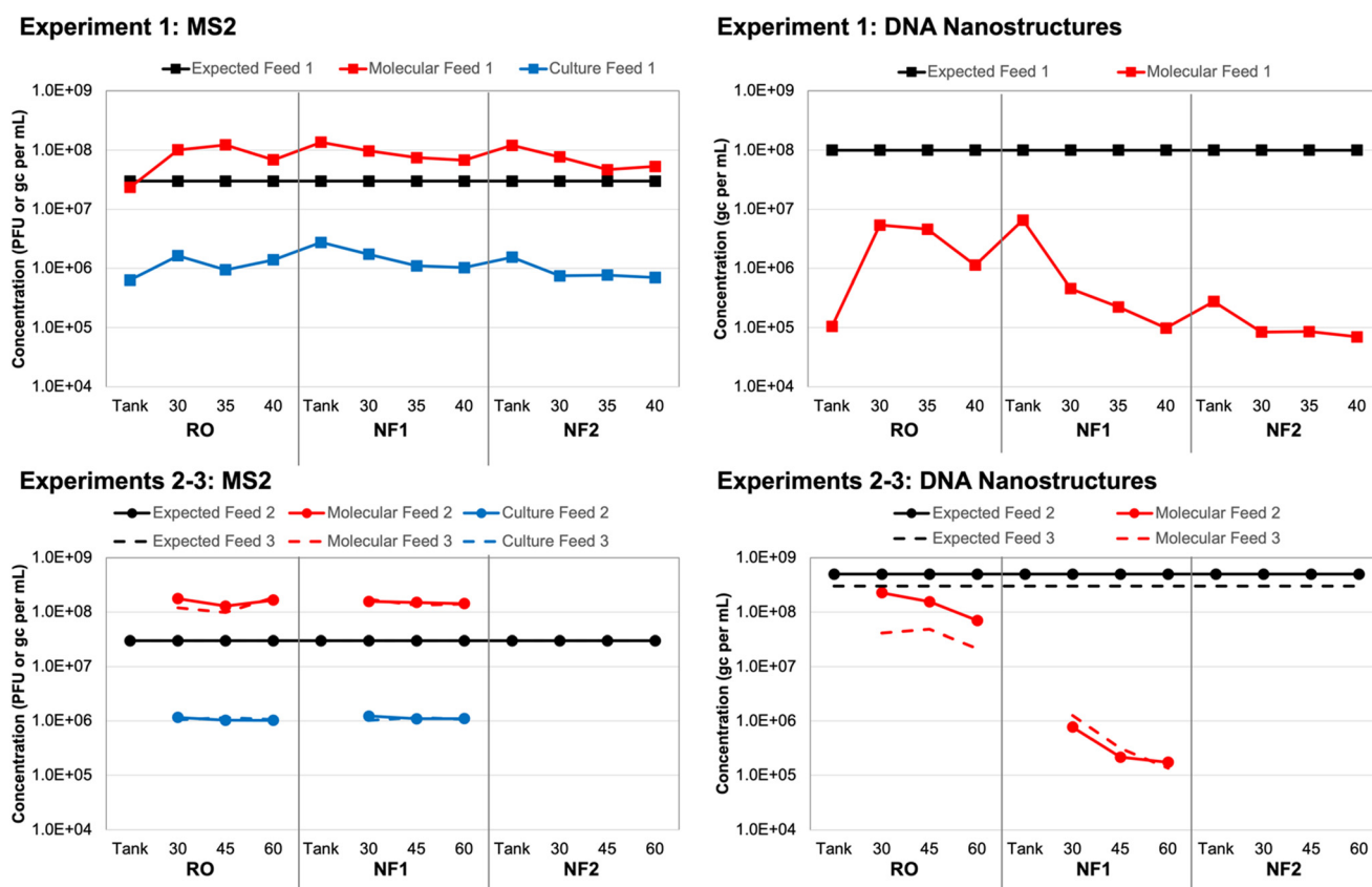
Fig. 1 Expected and observed membrane feed concentrations of (left) MS2 bacteriophage and (right) DNA nanostructures in three spiking experiments. New feed water was prepared for each of three independent spiking experiments, with (top) experiment 1 comparing three different membranes and (bottom) experiments 2 and 3 comparing only one reverse osmosis (RO) and one nanofiltration (NF) membrane. Samples were collected in the spiking tank (experiment 1 only) and membrane feeds at multiple time points (experiment 1: 30, 35, 40 min; experiments 2–3: 30, 45, 60 min) and analyzed using culture and molecular methods for MS2 and molecular methods only for the DNA nanostructures.

Based on spiking experiment 1, culture-based MS2 concentrations in each tank sample ( i.e. , time 0 for each