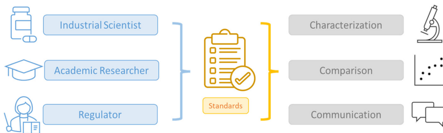
Fig. 1 Standards are developed as a result of the work of different collaborating stakeholders. Standards will help with characterizing and comparing different microphysiological systems, and with communication between stakeholders.

The working groups leading the efforts towards the development of MPS standards consist of stakeholders from academia, funding agencies, regulators, and industry. At the “Workshop on Standards for Microphysiological Systems” held at Michigan State University (USA) April 2023, the participants emphasized the importance of sharing results and ideas generated by different working groups. This workshop was organized by the OoC/ToC Engineering Standards Working Group (USA) and included members from the working group and other representatives from academia, industry, Food and Drug Administration (FDA), National Institute of Standards and Technology (NIST), National Institutes of Health (NIH), and