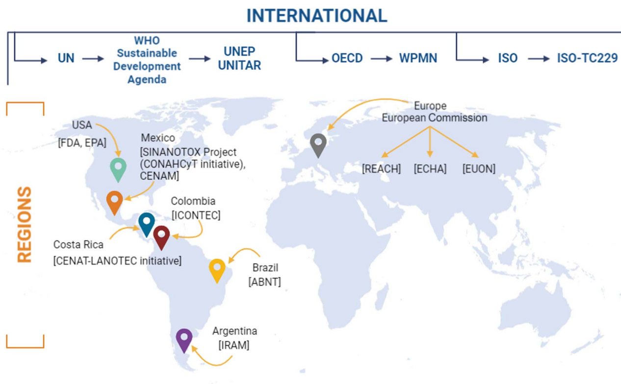
Fig. 4 National and international authorities, agencies and initiatives developing frameworks, legislations, and guidelines for nanomaterials. UN, United Nations; WHO, World Health Organisation; UNEP, United Nations Environment Program; UNITAR, United Nations Institute for Training and Research; OECD, Organisation for Economic Cooperation and Development; WPMN, Working Party on Manufactured Nanomaterials; ISO, International Organisation for Standardisation; ISO-TC229, International Organisation for Standardisation Technical Committee 229; USA, United States of America; FDA, Food and Drug Administration; EPA, Environmental Protection Agency; SINANOTOX, National Nanotoxicological Evaluation System Initiative; CONAHCyT, National Council of Humanities, Sciences and Technologies; CENAM, National Centre of Metrology; CENAT, National Centre of High Technology; LANOTEC, National Laboratory of Nanotechnology; ICONTEC, Colombian Institute of Technical Norms; ABNT, Brazilian Association of Technical Norms; IRAM, Argentinian Institute of Normalisation and Certification; REACH, Registration, Evaluation, Authorisation, and Restriction Chemicals; ECHA, European Chemical Agency; EUON, European Union Observatory for Nanomaterials. Original creation (using Excel and Biorender programs) based on information obtained from ref. 12, 31, 79–81, 94, 98, 115, 124–137, 143, 144, 159, 180, 189, 202–204, 269.

The momentum of nanotechnology development, establishment, and consolidation paths varies and differs between