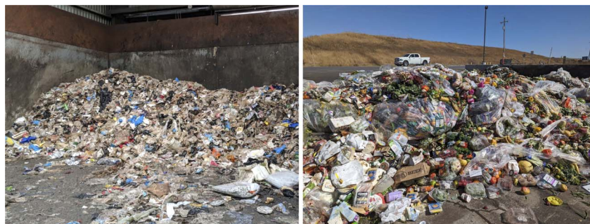
Fig. 3 Images of plastic contamination in organic waste streams. Photos taken at Zero Waste Energy Development Company in San Jose, CA and Yolo County Central Landfill in Woodland, CA.

Implementing more circular plastics systems requires handling an increasingly variable set of feedstocks. Most recycling technologies are polymer-specific and require fairly pure input streams. 4 In short, they are not tolerant to contamination from other plastics or non-plastic materials; some contaminants (such as metals or chlorine-containing compounds) may be more problematic than others. Understanding the nature of likely plastic waste feedstock streams is important because the level of contamination in an input waste stream to a recycling process and the associated need for preprocessing can have a substantial impact on the final LCA results of a circular plastic system. 13