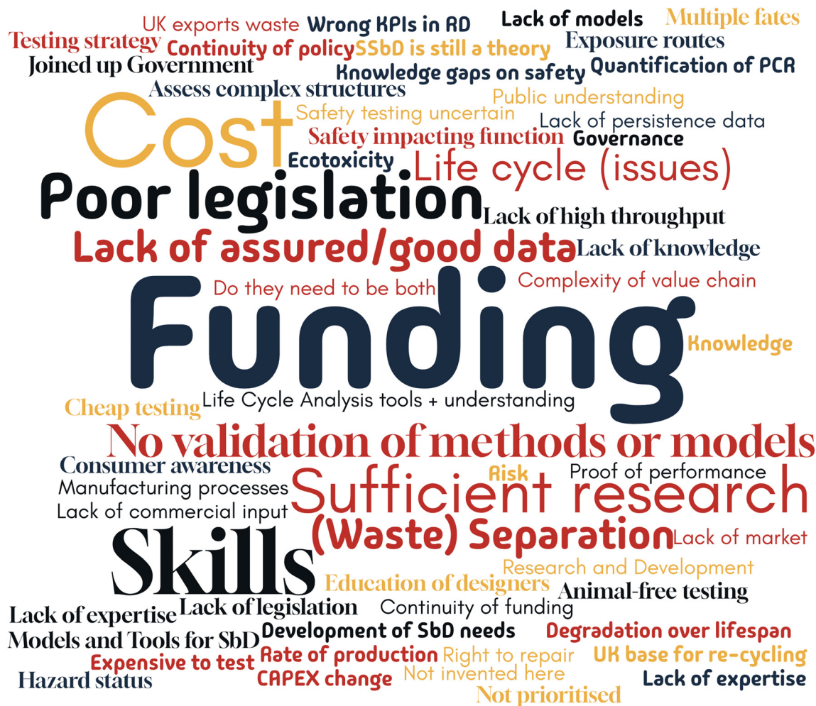
Fig. 2 Word cloud response to the question – What are the barriers to create Advanced Materials that are both safe and sustainable by design? (81 responses). Note that limited preprocessing of responses was undertaken prior to generating word clouds to group similar terms and harmonise.

To improve this situation, participants suggested that the following initiatives could be considered: