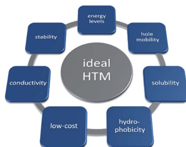
Fig. 2 Schematic representation of summarized HTM properties required for PSCs in an ideal case.

Among the inorganic hole conductors, only very few examples achieving high efficiency have been shown in the literature. Due to the limited choice of suitable materials, inorganic HTMs remain quite an unexplored alternative to the organic ones. The