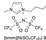
Fig. 1 The ionic liquid 1-butyl-3-methylimidazolium bis(trifluoromethanesulfonyl)imide ([bmim][N(SO 2 CF 3 ) 2 ], 3 ) used in this study. It should be noted that this anion might also be named as a secondary (sulfonyl)amide. 57 However, imide nomenclature is also reasonable 58 and serves to emphasise the two substituents, along with being consistent with previous work and what is used by the community in, for example, chemical catalogues.

This plot is generally the same shape as has been observed for some, 14,16,18 though not all, 19 related S_N1 reactions; the rate constant increases at low mole fractions of the salt 3 compared to the molecular solvent and then decreases at higher mole fractions of the salt 3 . However, it is the differences between this and previous cases that are significant. In this case, the maximum rate constant increase occurs at \chi_3 = 0.02