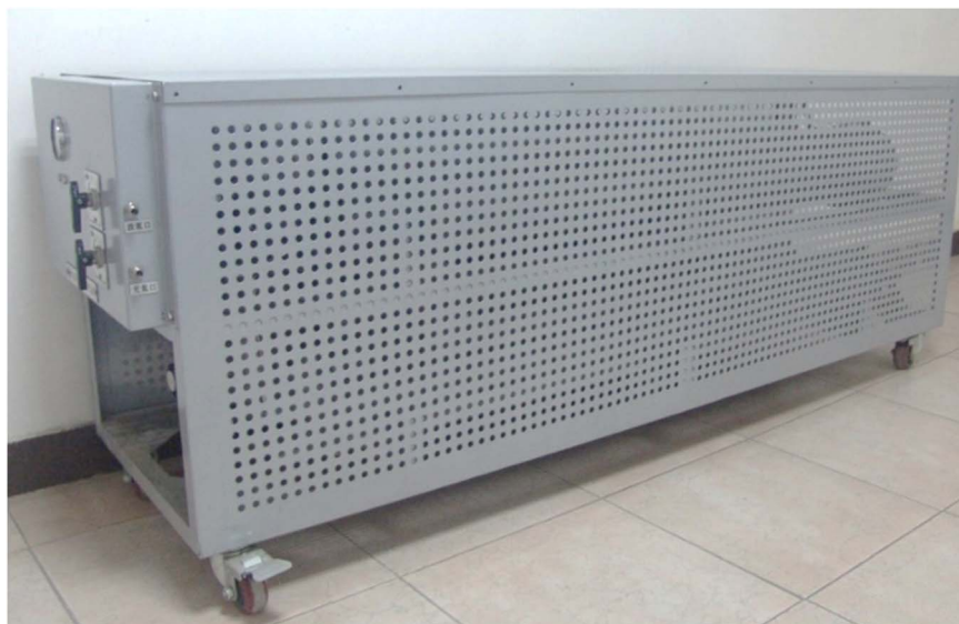
Fig. 4 A hydrogen storage system with modularized structure.