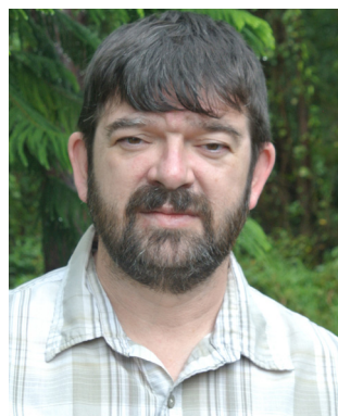
Vladimir N. Uversky

In the comprehensive review, Ernst et al. 27 emphasized: “While all of the known structures of microbial rhodopsins show a common tight \alpha -helical bundle of 7TM helices surrounding the retinal chromophore, there is substantial variation in the arrangement of side chains, the structure of the