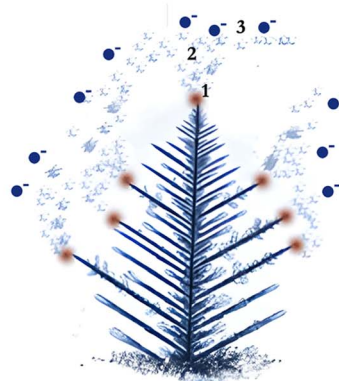
Scheme of ion emission from ice structure