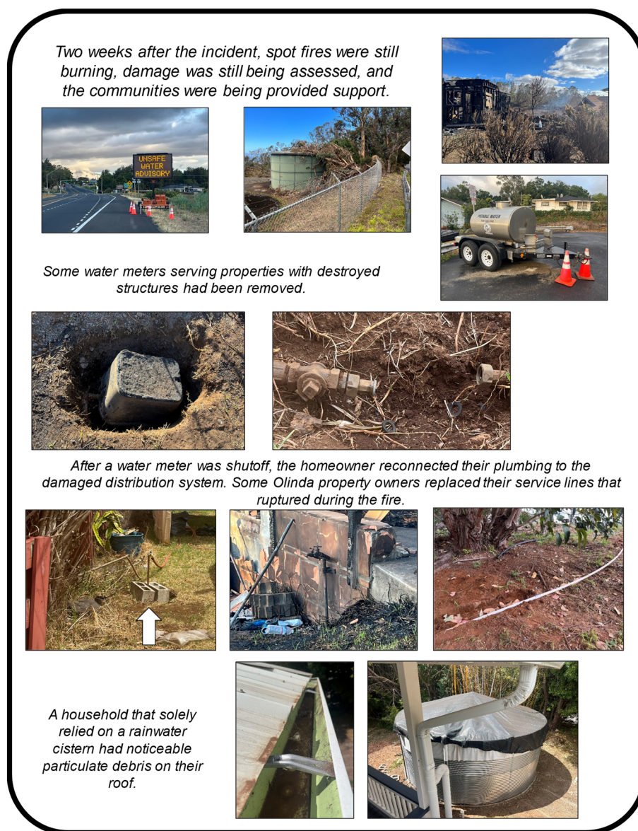
Fig. 2 Two weeks after the wildfire and the evacuation orders had been lifted, some fires were still burning, and various damage and household responses were observed.

The following results reflect our study's bias toward households affected by the Kula Fire: a majority of households that evacuated (7 of 11) either returned to their