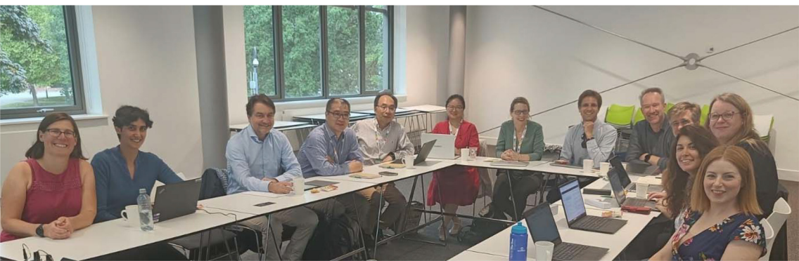
Fig. 1 2009 Polymer Chemistry Editorial Board meeting (top) and 2024 Polymer Chemistry Editorial Board meeting (bottom).