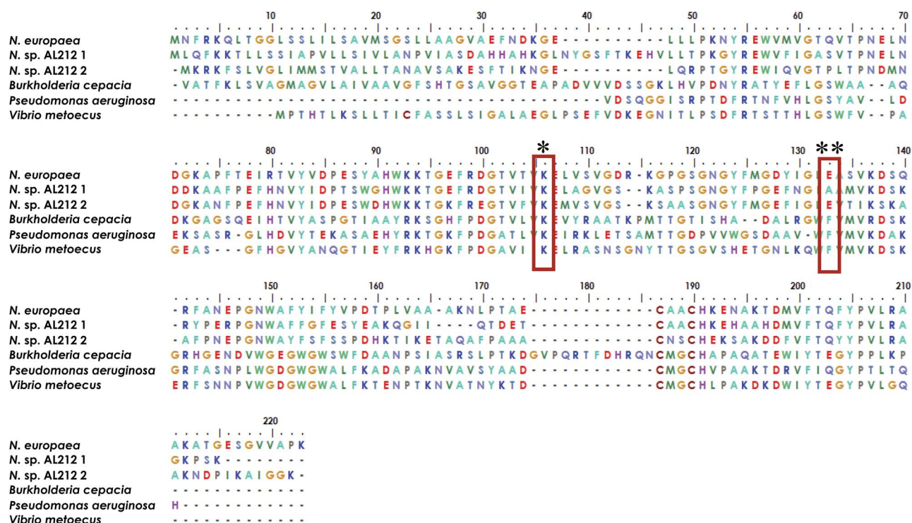
Fig. 9 Sequence alignment generated using MEGA X software 35 showing homology between cyt P460 genes from N. europaea , the two cyt P460 sequences from N. sp. AL212 , and genes predicted from mammalian pathogenic bacteria Burkholderia cepacia , Pseudomonas aeruginosa , and Vibrio metoecus . * indicates conserved Lys cross-link, ** indicates the critical second-sphere Ala/Glu/Phe residue.

residue in position 131, as shown in the present work. This theory accords with the evolutionary trajectory of HAO into oxidative chemistry. HAO belongs to a larger family of multi-heme c enzymes, including hydrazine oxidoreductase (HZO), octaheme cytochrome c nitrite reductase (ONR), and penta-heme cytochrome c nitrite reductase (NrfA). It is believed that the presence of additional protein cross-links to the catalytic heme are what distinguish enzymes with oxidative chemistries from those with reductive chemistries. 36,37 Comparative homology of currently annotated cyt P460 sequences would suggest distinct classes of cyt P460 which contain different residues (e.g. glutamate/aspartate, alanine, phenylalanine, Fig. 9) in this crucial second sphere position. In fact, the Nitrosomonas sp. AL212 genome contains two cyt P460 sequences (Fig. 9), one that contains Ala131 (the focus of this study) and one that is predicted to have a glutamate in this position (though the latter also contains a CXXCH heme-binding motif different from the CAACH motif observed in the former AL212 cyt P460 and N. europaea cyt P460). 38 It is likely that this second cyt P460 behaves in a manner similar to N.