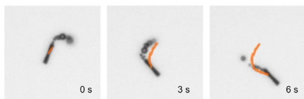
A Time lapse of \text{MnO}_2 micromotor trajectories at 2 wt. % \text{H}_2\text{O}_2