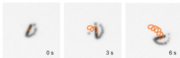
C Time lapse of \text{MnO}_2/\text{Lac} micromotor trajectories at 2 wt. % \text{H}_2\text{O}_2