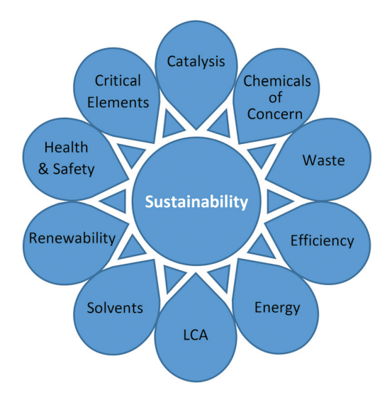
Fig. 1 Summary of the key parameters covered by the metrics toolkit.

A gap analysis was performed to compare current methods against the lifecycle of a typical active pharmaceutical ingredient (API). Subsequently, a number of 'key parameters' were identified which were chosen to cover a comprehensive range of relevant issues regarding the synthesis of chemical products. In this way, the focus was expanded significantly from simply adopting a traditional mass inputs/outputs approach. A summary of the key parameters is shown in Fig. 1. In order to be included in the toolkit, parameters needed to meet the criteria of being able to be practically and consistently measured/ assessed in a laboratory based setting. Following an in-depth critical analysis, favoured quantitative metrics were selected to cover the key parameters. These were supplemented by additional qualitative parameters (where no straightforward calculation is possible).