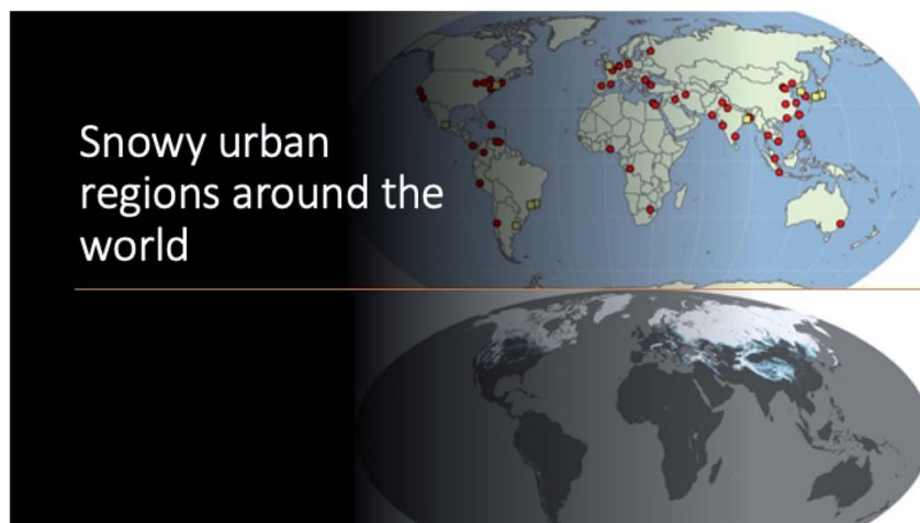
Fig. 2 The top world map shows the major cities of the globe, and the bottom picture shows snowy regions in the world. Note that in the Southern Hemisphere, there are several cities in the mountainous areas which receive snow (white-blue dots). The original graphs were obtained from the public domains made by the public maps made by two organizations: United Nations (UN) and NASA. We herein modified them by giving 3-dimensional effects, and hence the original pictures are changed. 19,20

gases and particles. 13,14 In polluted urban regions, snow has been shown to be effective for uptake of particulate matter, including airborne nanoparticles. 15 Yet, after snow events and upon melting–freezing cycles, the emission of airborne nanoparticles to the atmosphere is observed. 15 In urban regions, vehicle combustion particulate emission has been shown to alter snow composition. 14,16 Furthermore, the usage of salt