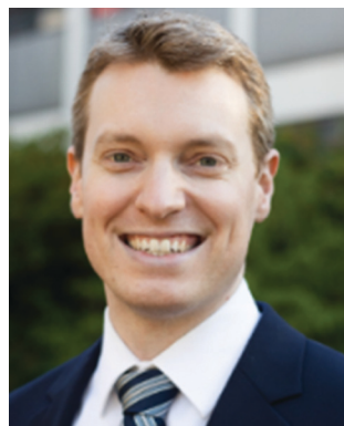
Zachary M. Hudson

† Electronic Supplementary Information (ESI) available: A synthetic scheme towards aryl tetrazoles; ^1\text{H} and ^{13}\text{C}\{^1\text{H}\} NMR spectra, solvatochromic and AIE properties, nanosecond PL decay curves, cyclic voltammetry data, Tauc plots, time-resolved emission spectra and computational results for TTTD-3HMAT , TTTD-3tBu , TTTD-3ACR . See DOI: https://doi.org/10.1039/d2tc01153k