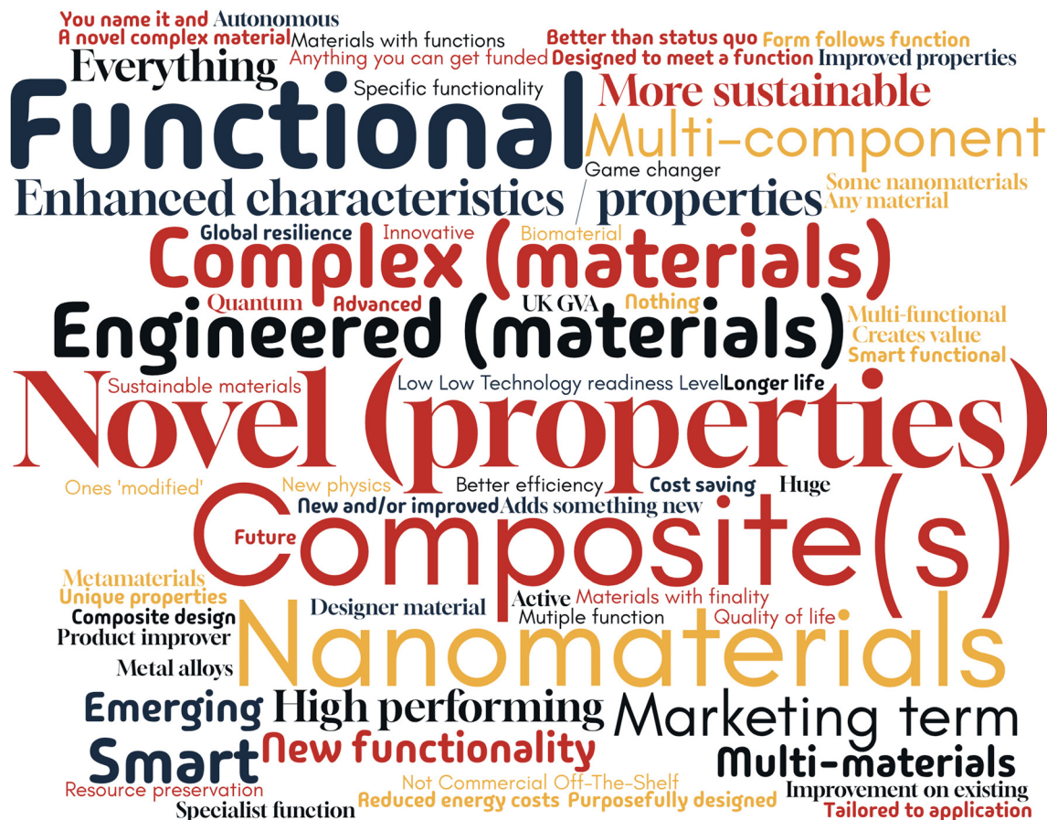
Fig. 1 Word cloud response to the question – What do you define as an Advanced Material? (111 responses). Note that limited preprocessing of responses was undertaken prior to generating word clouds to group similar terms and harmonise.

trust and acceptance by society, but the two most popular were understanding legislation and finance (Fig. S3†).