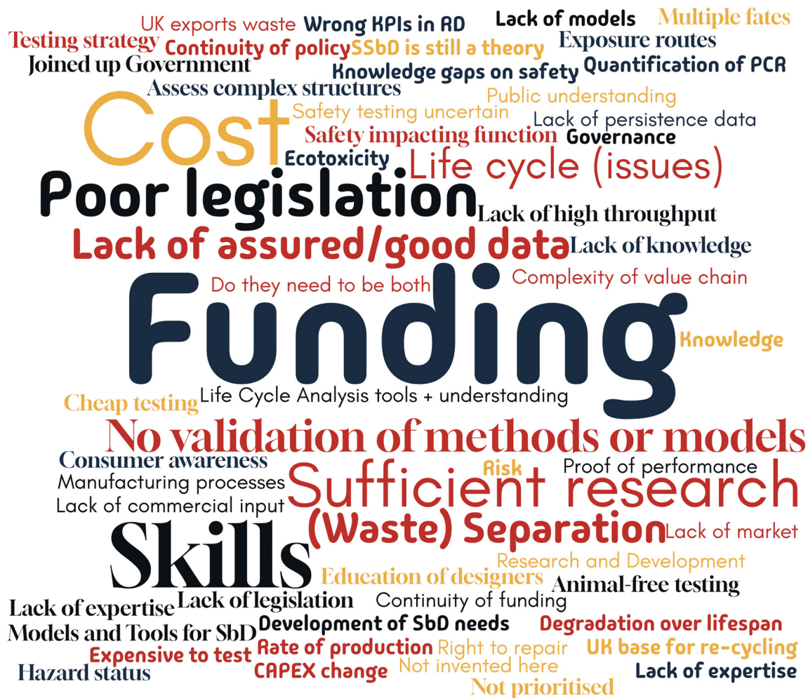
Fig. 2 Word cloud response to the question – What are the barriers to create Advanced Materials that are both safe and sustainable by design? (81 responses). Note that limited preprocessing of responses was undertaken prior to generating word clouds to group similar terms and harmonise.

To improve this situation, participants suggested that the following initiatives could be considered: