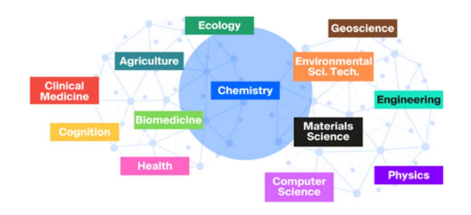
Fig. 1 Chemistry is usually depicted as "the central science". This simplified scheme depicts how chemistry is connected to many other fields based on the connectivity maps generated from bibliographical analyses (adapted from Rafols, Porter, and Leydesdorff, 2010).<sup>6</sup>

aromaticity.7 These results challenged the previous belief that carbon-carbon covalent bonds are immutable, opening doors to dynamic systems with interesting possibilities in the design of sustainable solutions, such as systems that actively adapt to the environment around them. Additionally, some of these molecules and materials could exhibit different behaviours based on external stimuli, "smart systems" with great potential in applications such as medicinal chemistry.8 Other opportunities include the design of molecules with features like sustainability already built-in chemists could create connections and design efficient "disconnections" that ensure efficient degradation to the original building blocks for recycling and upcycling.9 Similarly, organocatalysis (selected within the first IUPAC Top Ten list in 2019) is realising the potential of non-metallic compounds to catalyse enantioselective transformations efficiently and sustainably,10 supported by the award of the 2021 Nobel Prize in Chemistry to David MacMillan and Benjamin List. Currently, our chemical technologies transform only one-third of all raw materials into useful products - therefore, the vast majority is wasted. 11 New discoveries, such as dynamic bonds, could expand the toolbox of adaptive chemistry, a strategy that explores the potential of responsive materials to yield fascinating features such as self-