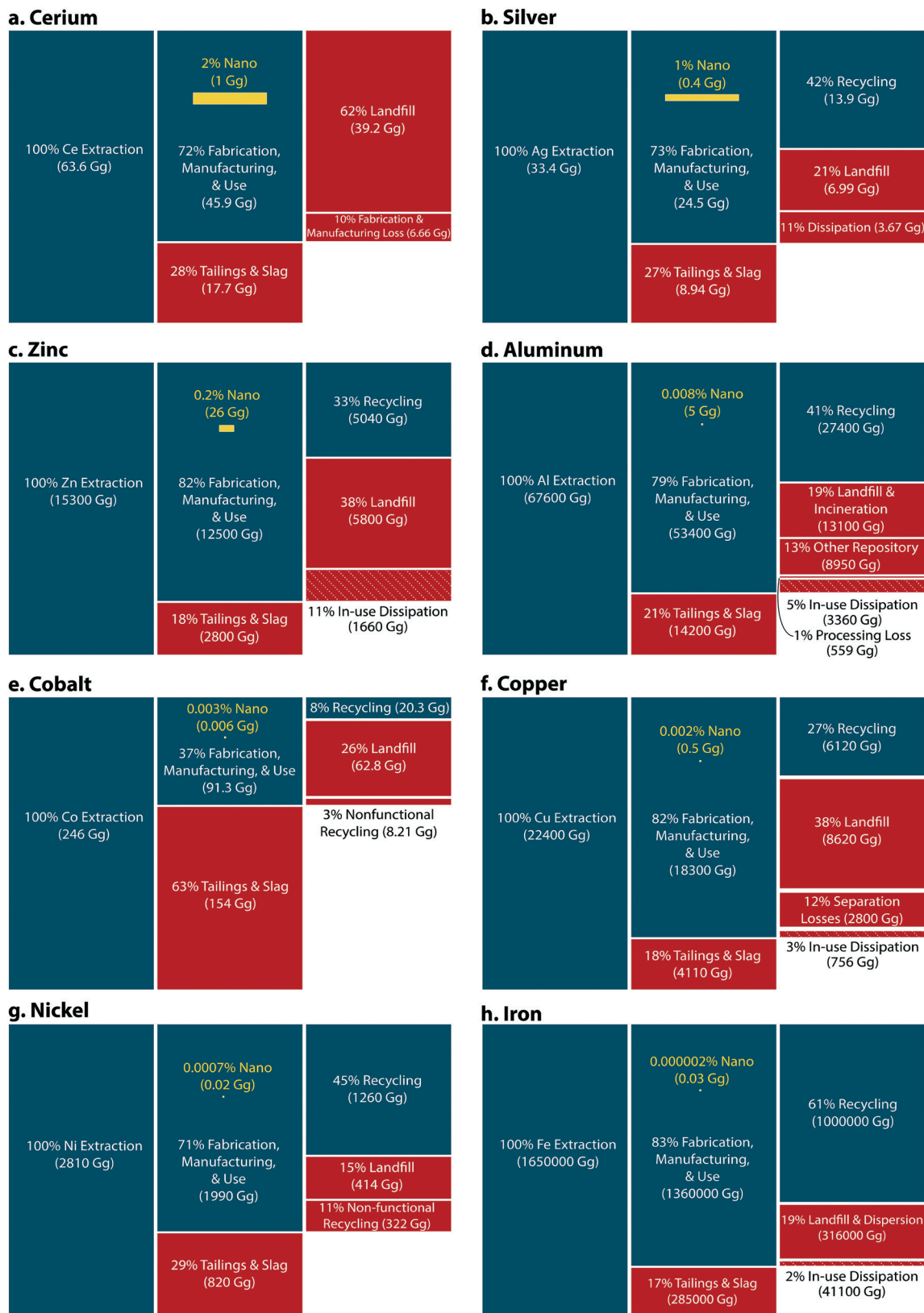
Fig. 4 Global material efficiencies across one life cycle of the particular element, from extraction of ore to end-of-life (left to right): production, fabrication, manufacturing, and use, and waste management/end-of-life. Red: losses from the anthropogenic cycle, where striped areas are losses during the use phase; blue: flows of metal to the anthropogenic cycle; yellow: engineered nanomaterial. Areas of rectangles reflect the magnitude of material flows as the percent of extracted ore in Gg of metal content, based on 2014 production volumes. Nanomaterial flows are based on high production volume estimates for 2014. All masses are in metal content of the particular element. All masses are rounded to 3 significant digits with the exception of nanomaterial flows. A glossary of terms is provided in the ESI† Table S1.