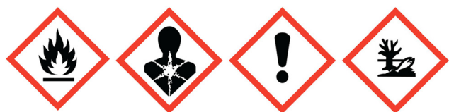
Fig. 5 Hazard pictograms for limonene in European Union countries (from left to right): GHS02 (flammable); GHS08 (serious health hazard); GHS07 (health hazard); GHS09 (hazardous to the environment).

Said otherwise, even though we are dealing with a health-beneficial substance 56 possessing immunomodulatory activity (it modulates T lymphocyte activity and viability), 62 its handling and use on a massive scale requires following appropriate regulatory guidelines to prevent accidents and occupational disease, as well as to mitigate risk in the case of accidents. Companies planning to use limonene as a natural product extraction solvent will therefore use extractors and solvent storage units intrinsically capable of preventing the accidental release of the terpene. The extraction and storage units containing the solvent will be kept in tightly closed containers placed in a dry, cool and well-ventilated place, away from heat, sparks and flame, strong acids and bases, oxygen, and other oxidizing agents. Workers working at the maintenance of the extraction and storage units will use protective gloves, eye-glasses, and clothing to reduce the risk of dermal and eye irritation in the case of accidental contact.