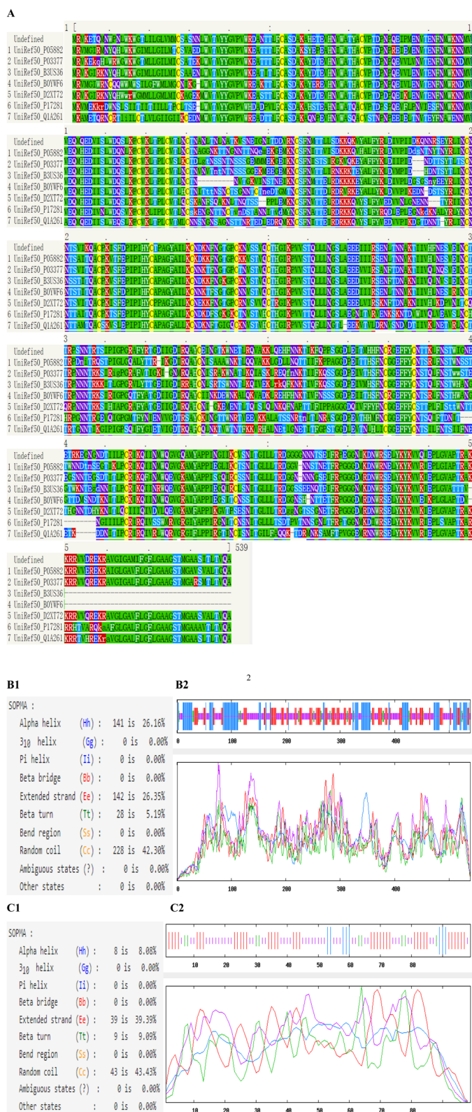
Fig. 2 The predicted secondary structure results of HIV-1 CRF01_AE gp120 and SD1. (A) Conservation analysis of the gp120 protein sequence. The amino acids were colored based on their conservation grades and conservation levels. (B1 and C1) The predicted secondary structure elements of gp120 and SD1 after computing the query sequences, \alpha -helix, extended strand, \beta -turn and random coil were colored in blue, red, green and yellow, respectively. (B2 and C2) The corresponding positions of \alpha -helix, extended strand, \beta -turn and random coil in gp120 and SD1.

homology modeling of the separate domain structures based on results previously determined by X-ray crystallography and were visualized using the program PyMOL. The gp120 core contained three domains: the outer domain, the inner domain, and the bridging sheet, the inner and outer domains were fixed by a four-strand beta-sheet, termed the bridging sheet presented in Fig. 3A1. The monomeric gp120 consisted of five conserved regions (C1–C5) and five highly variable regions (V1–V5). The conserved regions and variable regions of HIV-1 CRF01_AE gp120 and SD1 were listed in Table 2. Four helices 1, 4, 5 and 6 were found in the conserved C1, C4 and C5 regions of gp120, two helices 2 and 3 were predicted in the V2 region and the C3 region, which exhibited a conformation consistent with the findings from previous reports. 23,31 The SD1 peptide folded into a stable eight-stranded beta-sheet shown in Fig. 3A2.