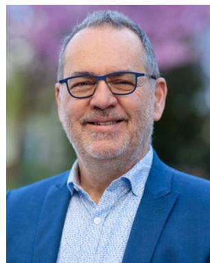
Jeffrey A. Hubbell

dynamic covalent polymers, self-healing materials, responsive adhesives, sustainable plastics, nanocellulose, polymers for battery applications, biomaterials and developing new synthetic methods for the construction of complex polymeric architectures.