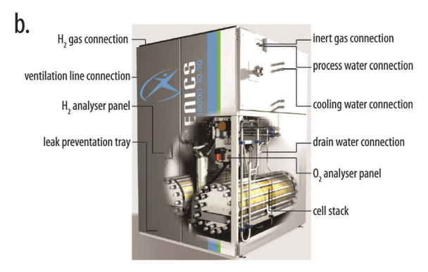
Fig. 1 (a) A schematic illustration of a simple U-tube configuration for water electrolysis. Voltage penalties (overpotentials) increase the total voltage required to operate the system at a given rate relative to the thermodynamically required potential, and include the kinetic overpotentials associated with the hydrogen-evolution and oxygen-evolution reactions (\eta_{\text{HER}} \text{ and } \eta_{\text{OER}}, \text{ respectively}), \text{ the concentration overpotential } (\eta_{\text{con}}), \text{ and } ohmic resistance loss ( \eta_{\text{ohm}} ). The total operating voltage of the system is given by the sum of the thermodynamic voltage for the water-splitting reaction and the total overpotential, \eta_{\text{total}} , for the system. (b) A schematic illustration of a commercially available (Hydrogenics) alkaline water electrolyzer with auxiliary components.7

transfer between most metal electrodes and a species in solution are slow for complex, multi-step electrochemical reactions, including reactions as simple as the two-electron reduction of two protons to form a single molecule of H<sub>2</sub>. <sup>12,13</sup> The overpotential partially overcomes the activation barrier for such processes, with the exact partitioning of the potential between the liquid and the kinetic barrier depending on the details of the system. Assuming an Arrhenius-type relationship for the interfacial charge-transfer kinetics yields an exponential relationship between the overpotential and the rate, or current density, j, of the reaction of interest: