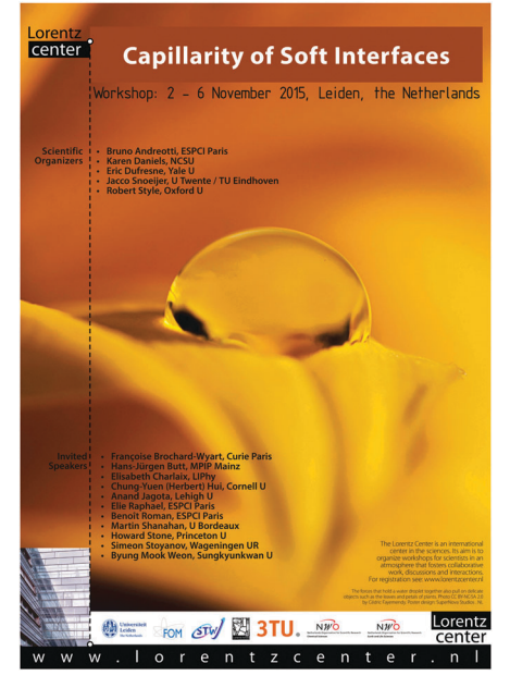
Fig. 1 This Opinion emerged from discussions during a workshop on Capillarity of Soft Interfaces, hosted by the Lorentz Center at the University of Leiden in November 2015. (Poster designed by SuperNova Studios, NL; photo by Cédric Fayemendy, Creative Commons License).