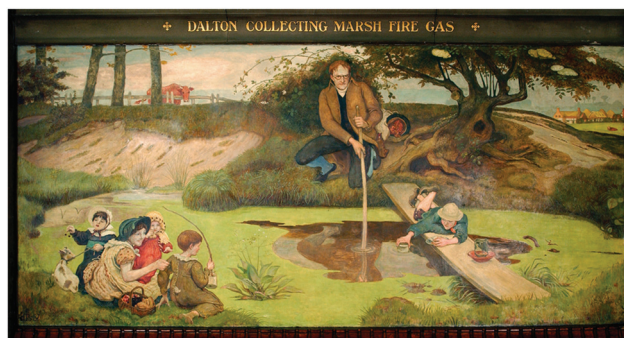
Fig. 2 "Dalton Collecting Marsh Fire Gas" is an 1887 mural by 1887 Ford Madox Brown in the Manchester Town Hall ( https://en.wikipedia.org/wiki/File:BrownManchesterMuralDalton.jpg ).