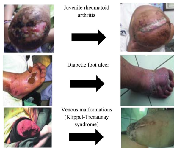
Fig. 3 Wound healing by coffee through human study. 81 Adopted with permission from ref. 81.

Histopathological studies on thirty-six New Zealand white rabbits supported the wound healing activity of green coffee bean extracts. Shahriari et al. 94 studied the green coffee bean extract in a full-thickness wound model. Coffee (10%) increased the wound closure rate, exhibited a shorter epithelialization