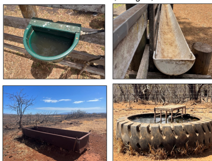
Fig. 3 Some agricultural water system assets were thermally damaged, destroyed, or impacted by particulate.

An underground fire was found during the field investigation.