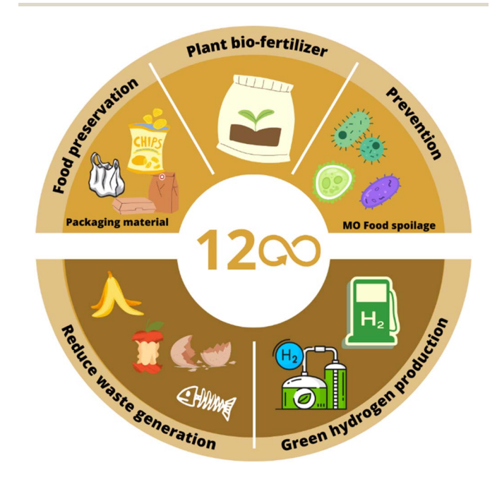
Fig. 5 Applications of traditional and green synthesized BMNPs related to SDG 12: responsible consumption and production.