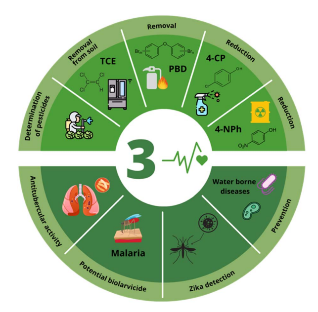
Fig. 3 Applications of traditional and green synthesized BMNPs related to SDG 3: good health and well-being.

electron transfer, as was also reported by Hasanjani and Zarei.108 Additionally, bimetallic NWs increased the electroactive surface area compared to the bare GCE. Finally, the biosensor indicated an acceptable reproducibility, and its limit of detection (LOD) was estimated to be 1.5 parts per trillion (ppt). This result was lower than the European maximum residue levels of malathion for courgettes, carrots, lettuces, and oranges as well as those obtained by Liquid Chromatography-Mass Spectroscopy method, in which pesticides at concentrations lower than 1.4 part per billion (ppb) cannot be detected.<sup>22</sup> These results show that BMNP-based biosensors can potentially be used to comply with pesticide regulations protecting food consumers.