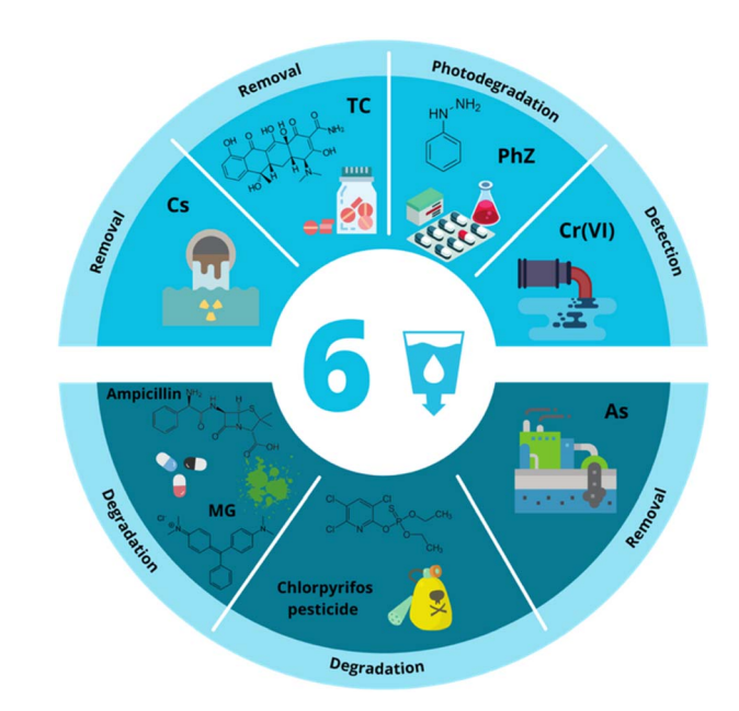
Fig. 4 Applications of traditional and green synthesized BMNPs related to SDG 6: clean water and sanitation.

According to van Vliet et al. , water scarcity refers to the lack of water in quantity and the deficit of water quality. <sup>126</sup> Their study shows that currently, the world's population suffers from severe