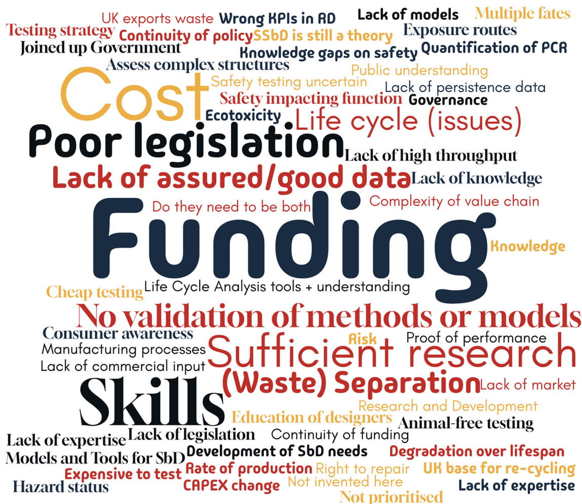
Fig. 2 Word cloud response to the question – What are the barriers to create Advanced Materials that are both safe and sustainable by design? (81 responses). Note that limited preprocessing of responses was undertaken prior to generating word clouds to group similar terms and harmonise.

To improve this situation, participants suggested that the following initiatives could be considered: